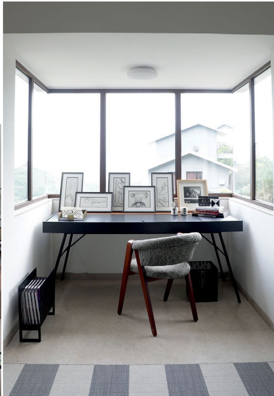
FROM LEFT On the upper level, an Alok Bal canvas is mounted on the wall by the stairway; A Pierre Jeanneret bench sits flush against the wall at the landing near a canvas by Suhasini Kejriwal FACING PAGE, FROM LEFT Metal candlesticks from Bansal's Brianna Collection are placed on a foyer table. Under it are a copper planter from an antique store in Jodhpur and a floral rug from Shivan and Narresh; Natural light streams in through the bay window at the landing, where a BoConcept desk, and other storage systems from Bansal's Brianna Collection are placed. The framed drawings on the desk are a gift from Nitin's friends