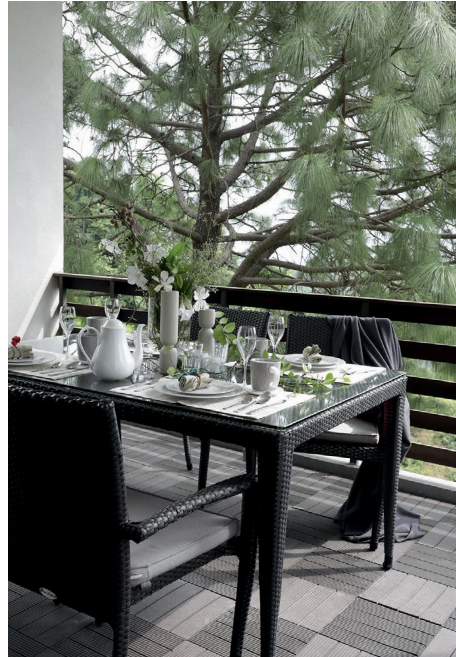
FROM LEFT One of the bedrooms on the upper level opens up to a breakfast nook with a view; The table top is decorated with BoConcept candle holders, napkin rings from Shades of India and Pure Home's white ceramic tableware

Aside from this corner, the upstairs has a lounge cum library and two bedrooms, each of which open onto outdoor balconies, one of them with a laid back breakfast table setting. Whether it's for these little cosy corners or for covetable pieces such as the Pierre Jeanneret seaters (bought, back in the 1990s, by Nitin) and objets d'art—the home's relaxed aesthetic is undoubtedly inviting. ♦